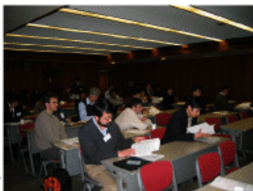
Snapshot of the Workshop

The International Workshop: Integrated Databases and DataGrid for Structural Biology and Molecular Biology, organized by JST (Japan Science and Technology Agency) and the Institute for Protein Research, Osaka University, was held on March 1st and 2nd, 2004 at Osaka University.