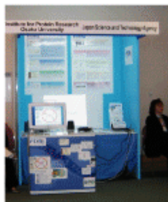
Exhibition booth at PRICPS 2004

The 1st Pacific-Rim International Conference on Protein Science and the 4th annual meeting of the Protein Science Society of Japan (PRICPS) was held April 14th- 18th, 2004, at Pacifico Yokohama, Japan. Our activities were introduced at the exhibition booth, where both demonstrations and presentations were given.